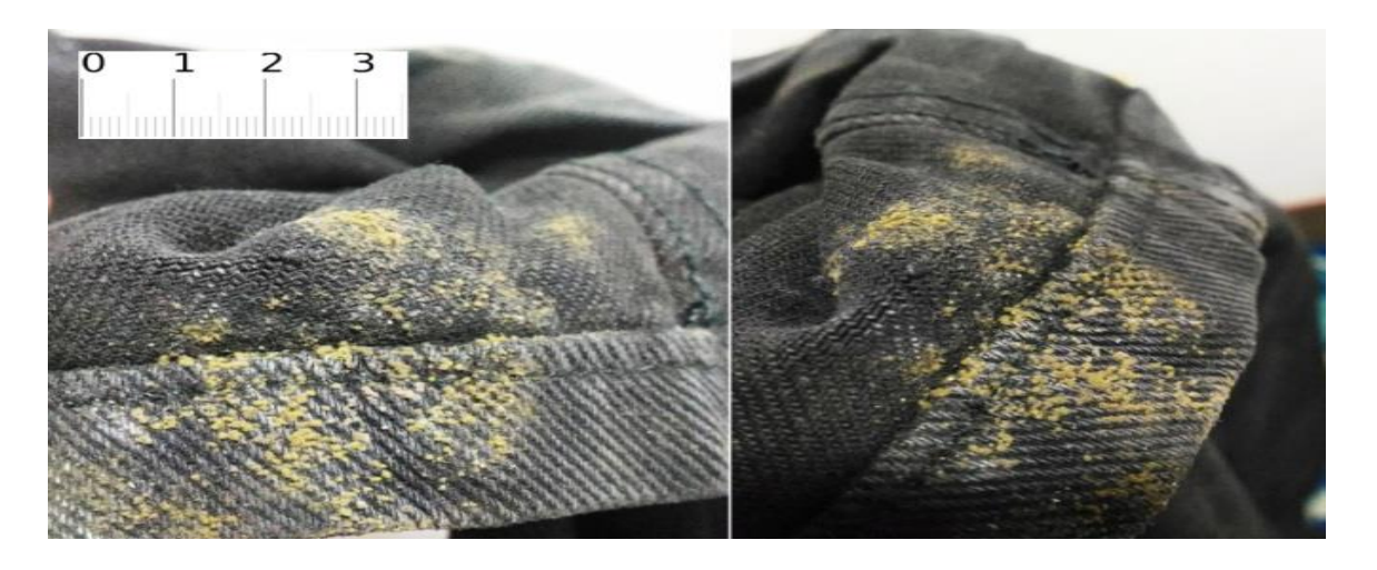
Figure 1. Ascocarp of fungi on moldy jeans

should be treated as Chaetomium globosum sensu lato for time being.