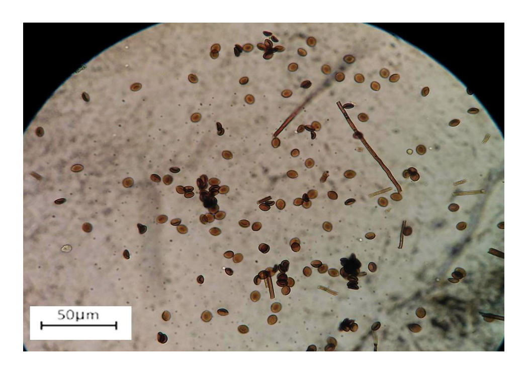
Figure 5. Ascospores characters of Chaetomium