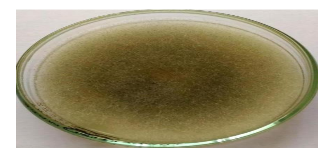
Figure 2. Colony of Chaetomium in PDA after 7 days