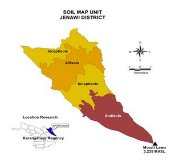
Figure 1. Soil Map Unit of Jenawi District, Karanganyar Regency, Central Java.

Suitable class (S1) means that the land factor do not inhibit plant growth and does not significantly affect land productivity. Moderate suitable class (S2) means that land characteristics can affect land productivity. Marginally suitable class (S3) means that land characteristics are difficult constraining factors and require large funds to overcome. Not suitable class (N) means that the characteristics of the land are a serious constraining factor and very difficult to overcome